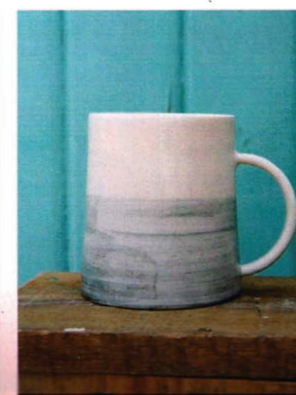
Opposite page: From top, Couture Cups, Cairo Small and Madrid, Twin Arc Bottles, Paris breakfast bowl.